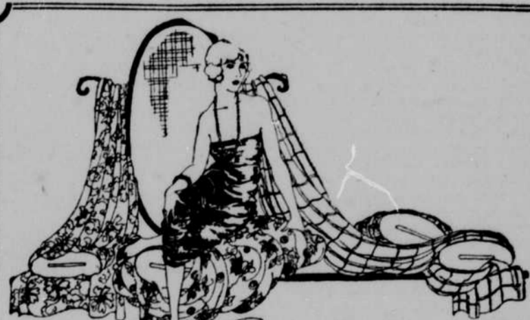
The new silhouette, oftentimes straight, has also taken a decidedly circular trend—most becoming and flattering vogue.

in new dinner gowns of crepe with shadowy lace and fur.