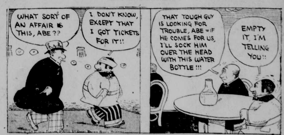
He's a Scientific Scrapper.