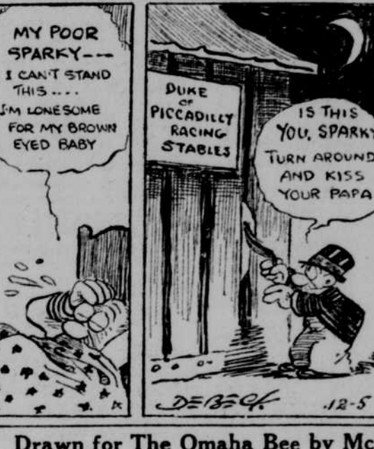
Drawn for The Omaha Bee by McManus