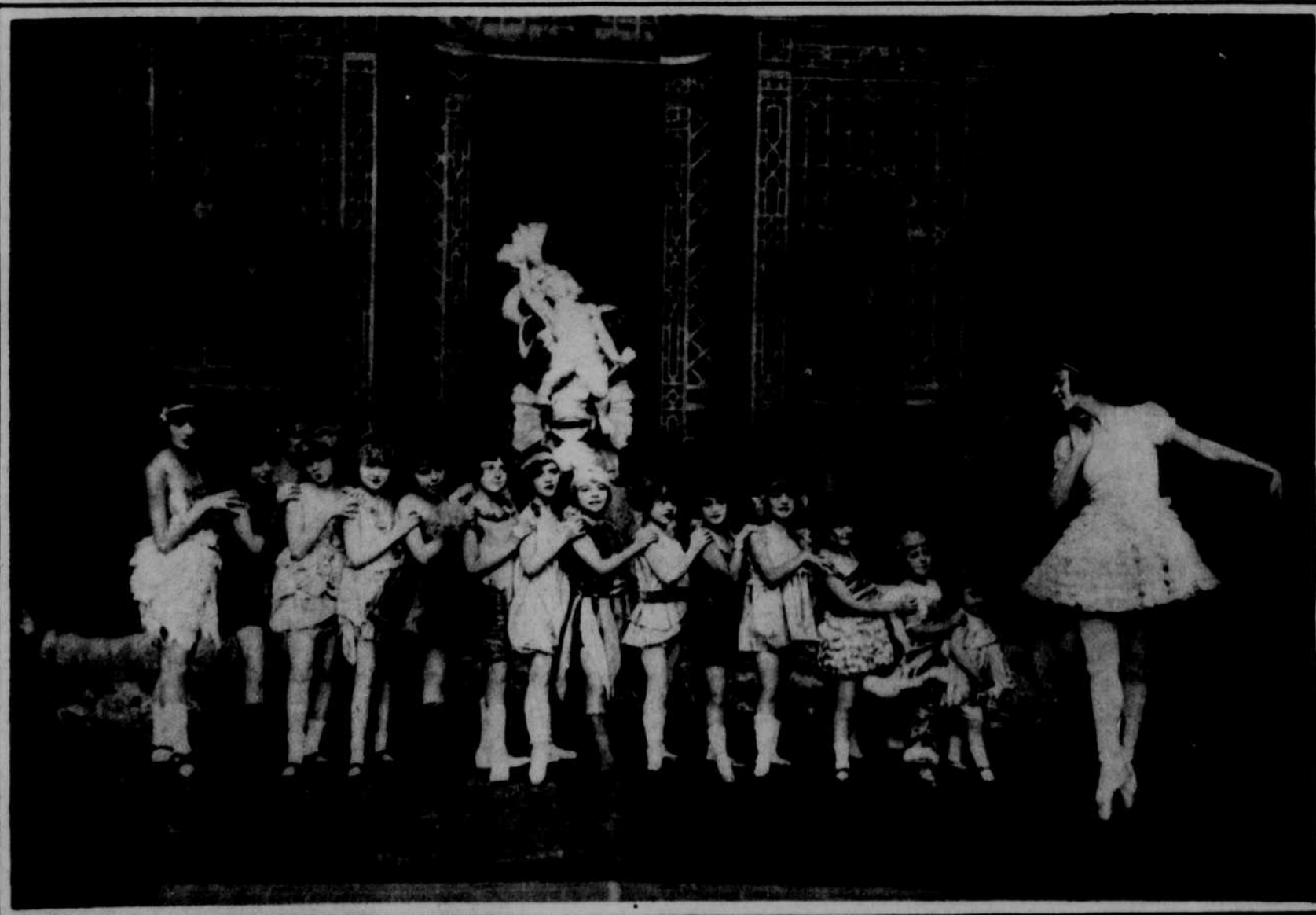
The National Stage Children's Association will present "The Juvenile Follies Revue of 1925." The children in the revue will compete for $10,000 in scholarships. Winners will give a special performance at the White House for President and Mrs. Coolidge. A group of the stage children.