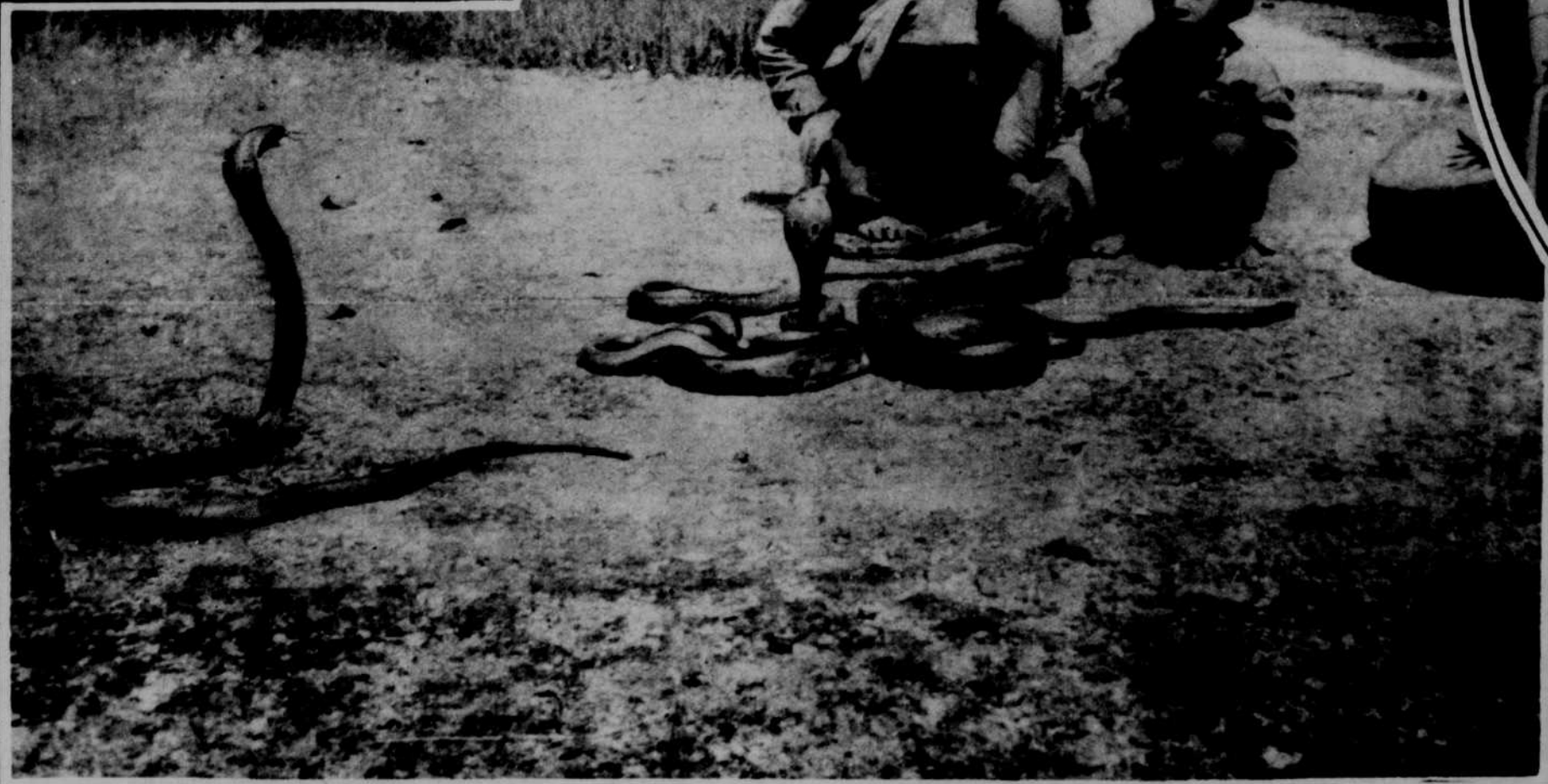
Teaching the young idea how to snake charm. Hindu snake charmer giving his son his morning lesson in the gentle art of snake-charming utilizing three deadly King Cobras and two common grass snakes, harmless, to illustrate the fine points of the lecture. The youngster feeling uncomfortable at the approach of one of the cobras grasped his father's arms to the dissatisfaction of the head of the house. The picture was taken in Allahabad, India.