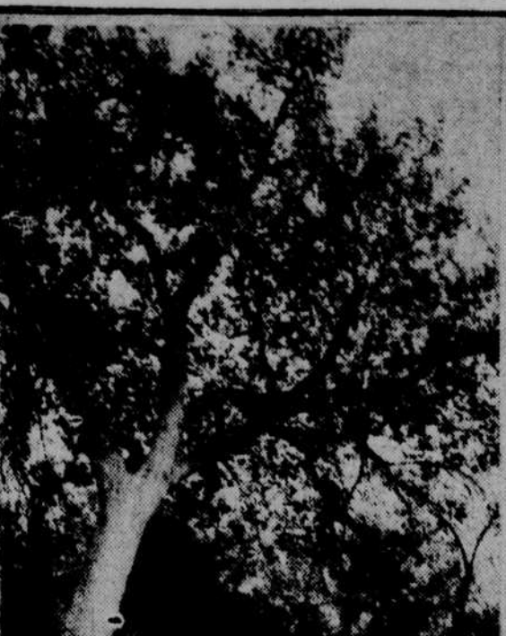
Two hundred-year old Elks on site of Lieut. Pike's Camp on Solomon river