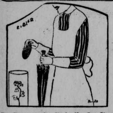
To Prevent the Umbrella Jar From Breaking.

Very often an umbrella par is broken when the umbrella is dropped Mass. into it. You can prevent this if you cut a piece of rubber to fit the bot tom of the jar and keep it in the jar. Use a piece of an old rubber or a stair tread. THE HOUSEWIFE.