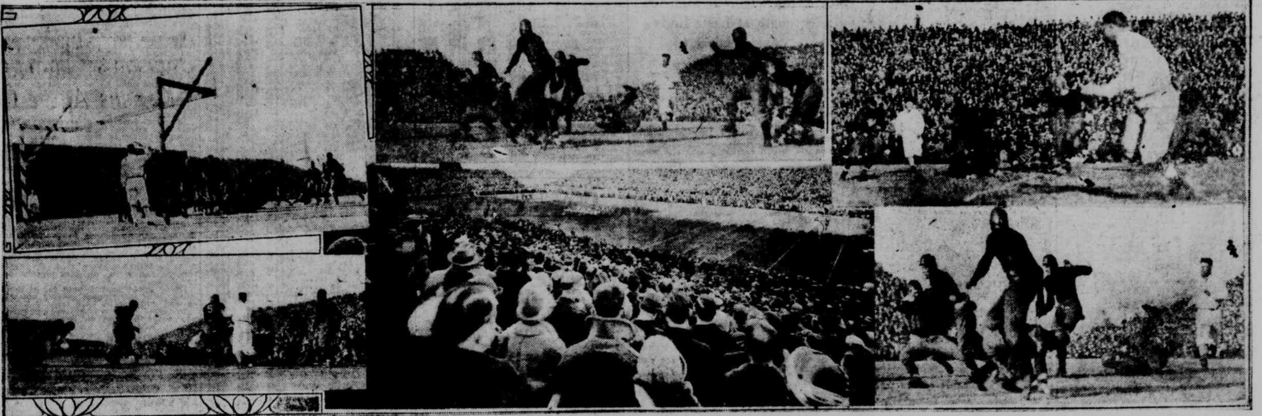
None of the big upsets of the past week Notre Dame defeated Nebraska 24 to 6 before a crowd estimated at 26,000. The upset didn't come when Notre Dame won, but when the South Benders copped by such a large score. The center photo in the above layout shows a section of the field. Both sides and ends of the wooden grandstands were packed with spectators. Nebraska gridster is seen tackling a Notre Dame backfield man. In the upper left hand corner Notre Dame added an extra point after making on an end run. In the lower right a touchdown. Crowley kicked the goal. In the lower left the Nebraska line stops a Notre Dame play.