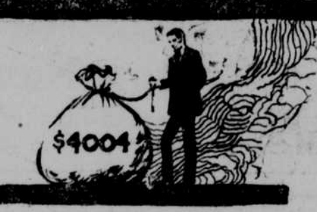
Per Capita Wealth