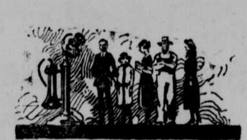
One Telephone to Every Five People