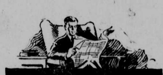
Shares Honors With One Other State in Percentage of Low Illiteracy