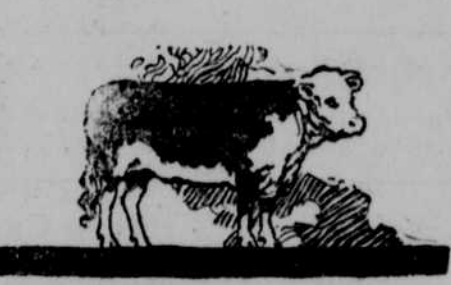
Leads in Per Capita Beef Prices