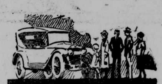
One Auto to Every Five Persons