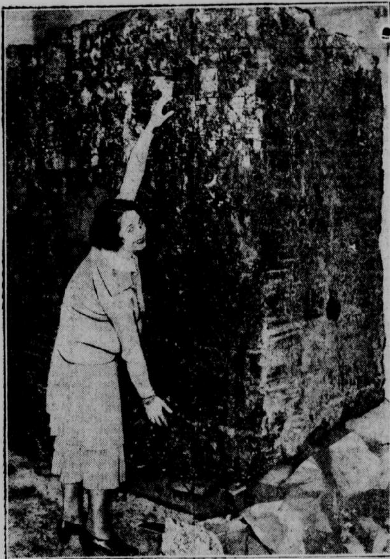
Chicago.—The above photo shows the largest lump of coal ever mined. It is at the Illinois products exposition, which is to be held at the Furniture Mart, 666 Lake Shore drive.

This lump of coal is said to be the largest piece of coal ever mined. It weighs 20,323 pounds and was taken from a mine in the famous Williamson county, Illinois.