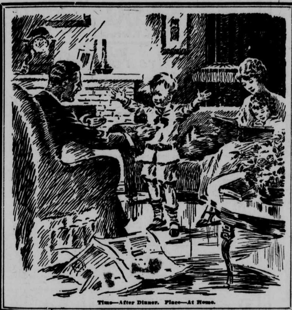
Time—After Dinner. Place—At Home.