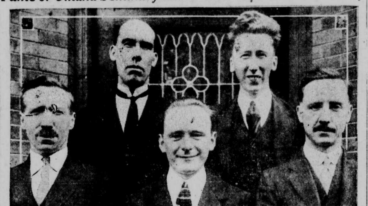
Here are five men who crossed the Atlantic to attend the Omaha Presbyterian Theological seminary...