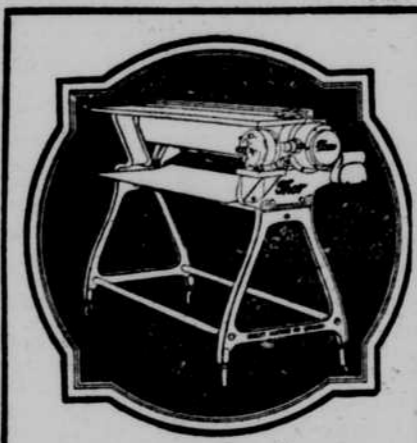
Thor Automatic Ironers $165

We have a marvelous selection of table lamps. All metal and glass assorted styles, colors and finishes. These lamps make wonderful gifts.