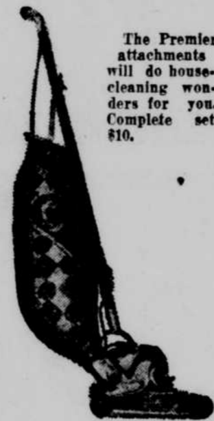
Premier Cleaners $60

The Premier Electric Vacuum Cleaner will clean your rugs thoroughly. The powerful suction and motor driven brush are special features.