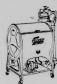
Thor Electric Washers $125 to $185

A complete assortment of toasters in all sizes. They are nickel plated and easy to clean.