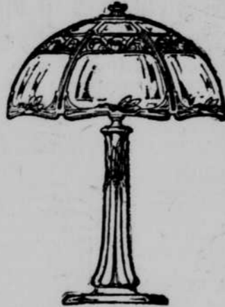
Table Lamps $14.95 to $55

The Renulife Violet Ray Health Builder will make you fit. Come in and let us show it to you.