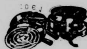
Electric Grills $9.85 to $15

Electric heaters are very handy for "cool spots." A perfect glow of heat for warmth.