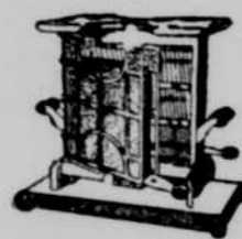
Electric Toasters $5 to $9

We have grills in both round and square type. They're nicely nicked and large size.