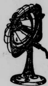
Radiant Heaters $6.50 to $10.50

The Premier Electric Vacuum Cleaner will clean your rugs thoroughly. The powerful suction and motor driven brush are special features.