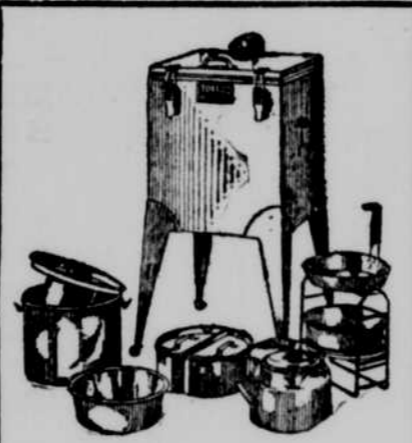
Toledo Electric Cook Stove $55 to $95

We have a complete assortment of prices and styles for every home. Low cost and better washing are features of the Thor.