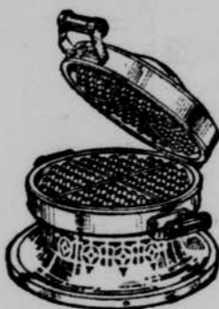
Waffle Irons $15 and $18

Electric and wonderfully efficient. With aluminum inside and nickel plated.