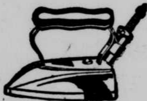
Electric Irons $5 to $7.50

Electric and wonderfully efficient. With aluminum inside and nickel plated.