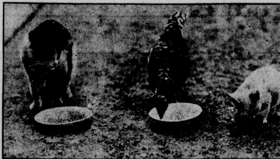
In the proverbially exclusive Boston, Mass. manner Tabby (left) tries to open a conversation with Miss Guinea Hen and the smart New England flapper on the right who is quite taken up with her meal.