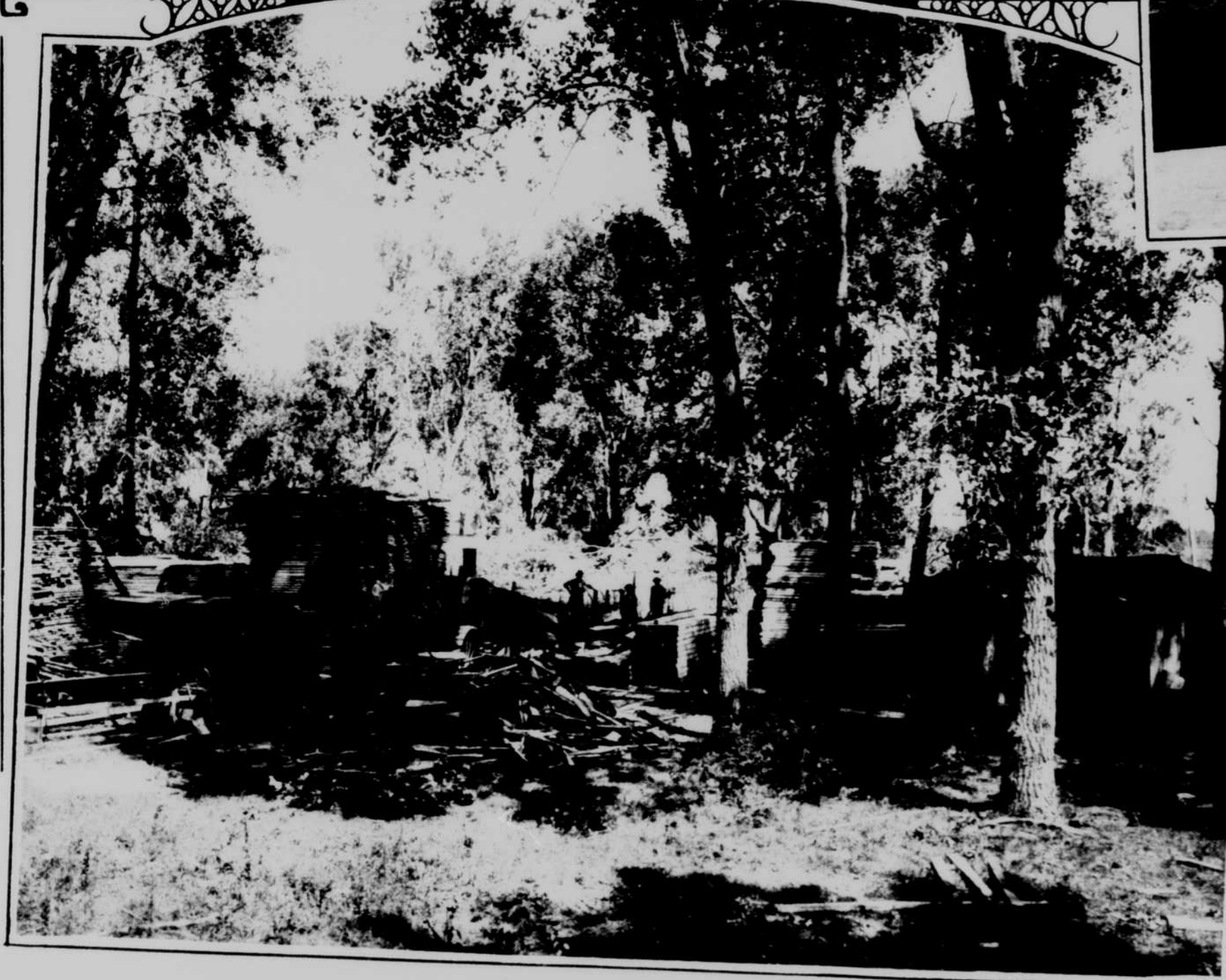
A BIT OF NEBRASKA TIMBER LAND. Charles A. Pease of Blair sawing lumber on one of the Woods brothers' farms near DeSota. There is 132,000 feet of lumber in this picture.