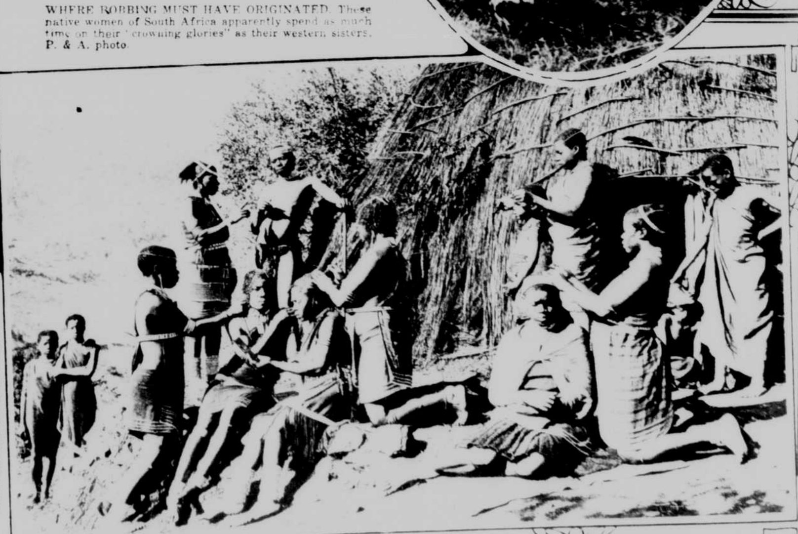
WHERE ROBBING MUST HAVE ORIGINATED. These native women of South Africa apparently spend as much time on their "crowning glories" as their western sisters.