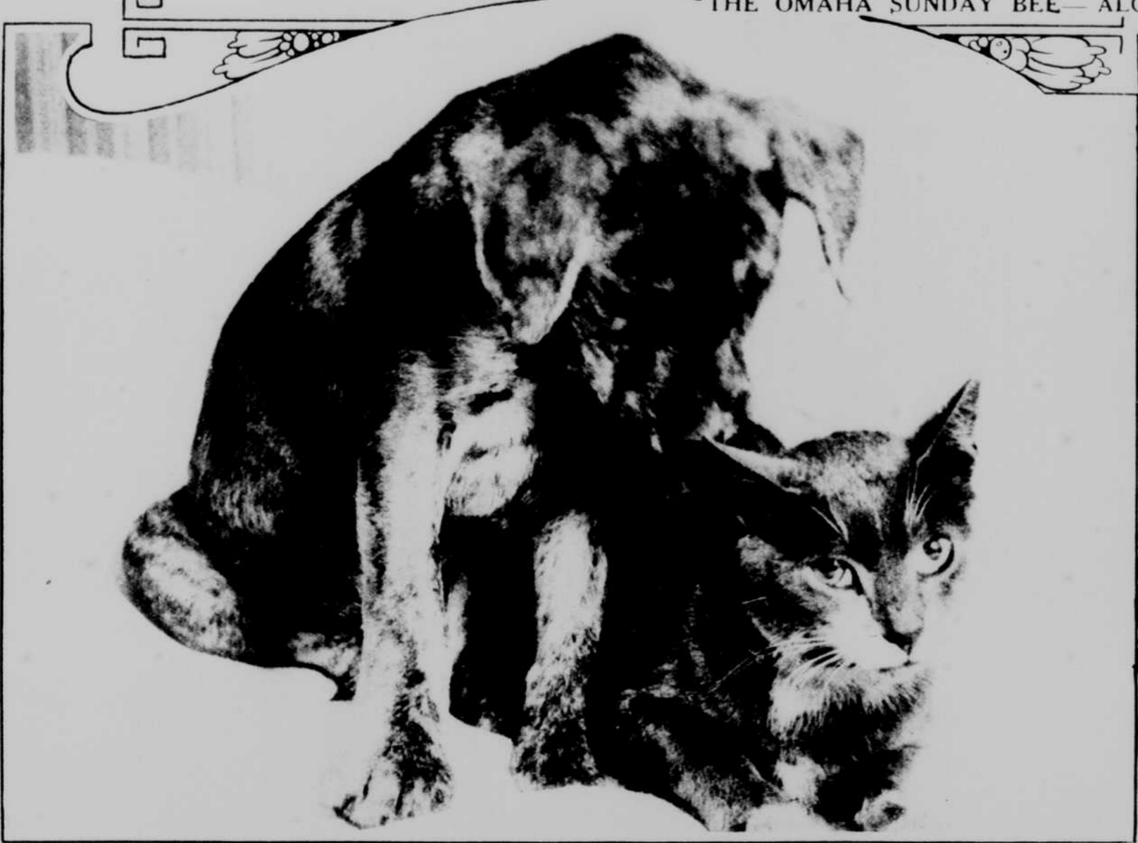
INSEPARABLE COMPANIONS —this cat and dog give the lie to the old adage that the canines and the feline do not get along. They play together like frolicsome puppies and rarely are seen away from each other.