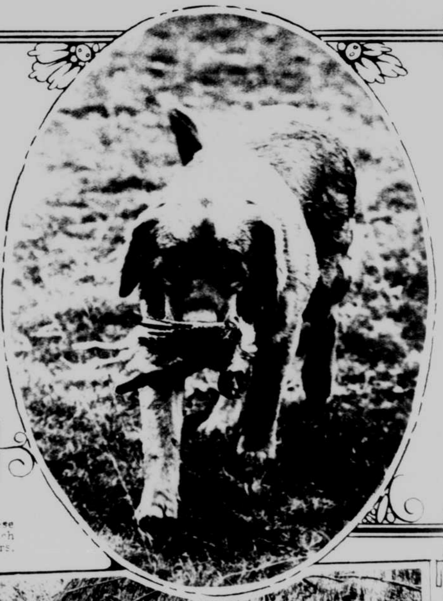
BRINGING HOME THE NOT THE BACON, but the partridge shot down by the member of a party of English hotel visitors who went to Woodlands farm near Exbridge, England the center of excellent hunting for partridge which are a particularly delicious food at this season of the year.