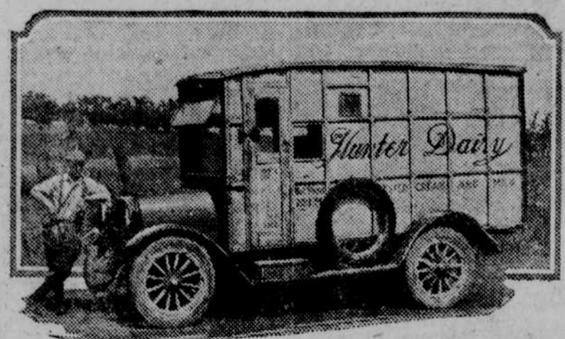
A familiar sight on the streets of Lansing is this speed wagon with nearly ten years of service to its credit.

One of the first cars that ever bore the name of speed wagon was delivered, as it came from the assembly line, to the Hunter Dairy, a company distributing its products in Lansing, Mich., home of the Roe Motor Car company and the speed wagon. That was late in 1914, nearly 10 years ago. With something over 400,000 miles to its credit, this speed wagon con-