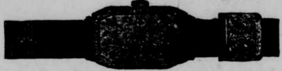
The Brandeis Store—Main Floor—East