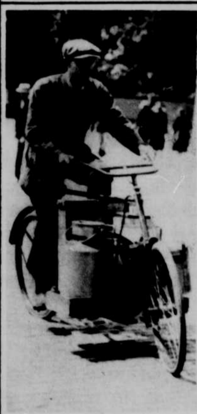
A model of compactness and convenience. An Amsterdam (Holland) milkman making his morning rounds with his supplies in easy reach. In this city the bicycle is still at the height of its popularity.