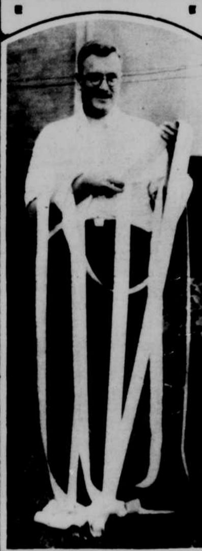
A letter written on rolls of adding-machine paper 150 feet long, containing between 15,000 and 20,000 words, that was dated at Chicago, July 7, and reached Denver the latter part of August.