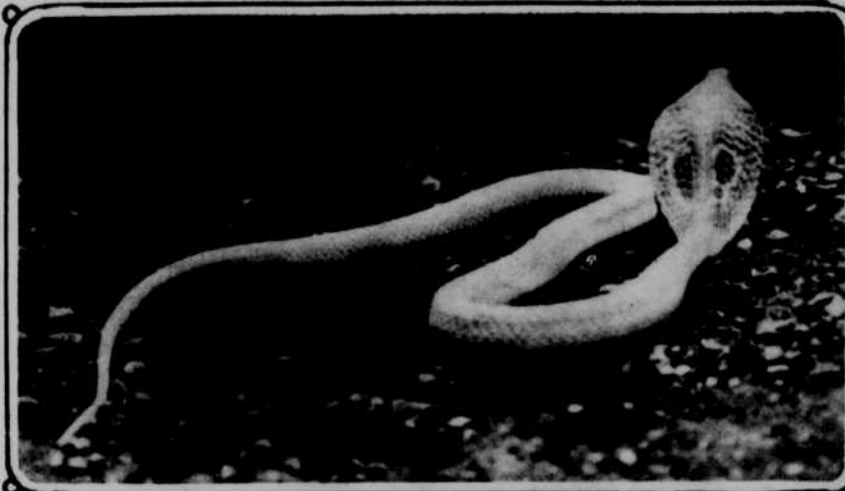
Looks like a member in good standing of the K. K. K. of the Cobras. When the hood is doing its stuff properly it shows a perfect pair of spectacles. This is a pure white specimen and is a recent arrival at the London Zoo—the first of its kind ever seen there. Even in India, its habitat, this sort of corba is found only once in many years.