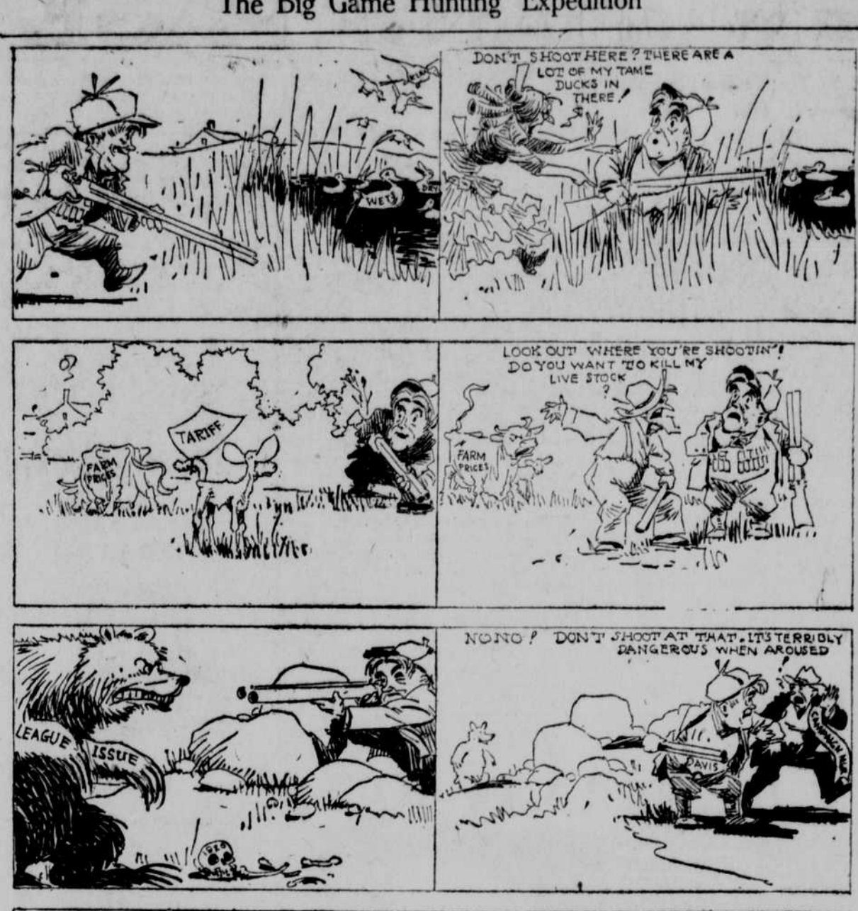
ABOUT ONLY PLACE HE CAN FIND TO ATTACK WITHOUT DANGER OF HITTING LOT OF DEMOCRATS