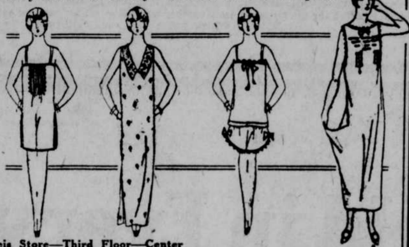
The Brandeis Store—Third Floor—Center

they would be lovely—and for such a low price!