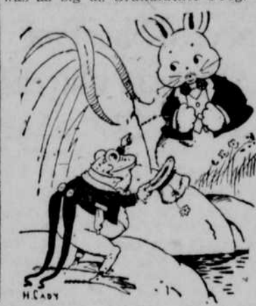
But Grandfather Frog wears a green coat!" cried Peter.

Think nothing ever commonplace Because no beauty is doth grace.—Grandfather Frog.