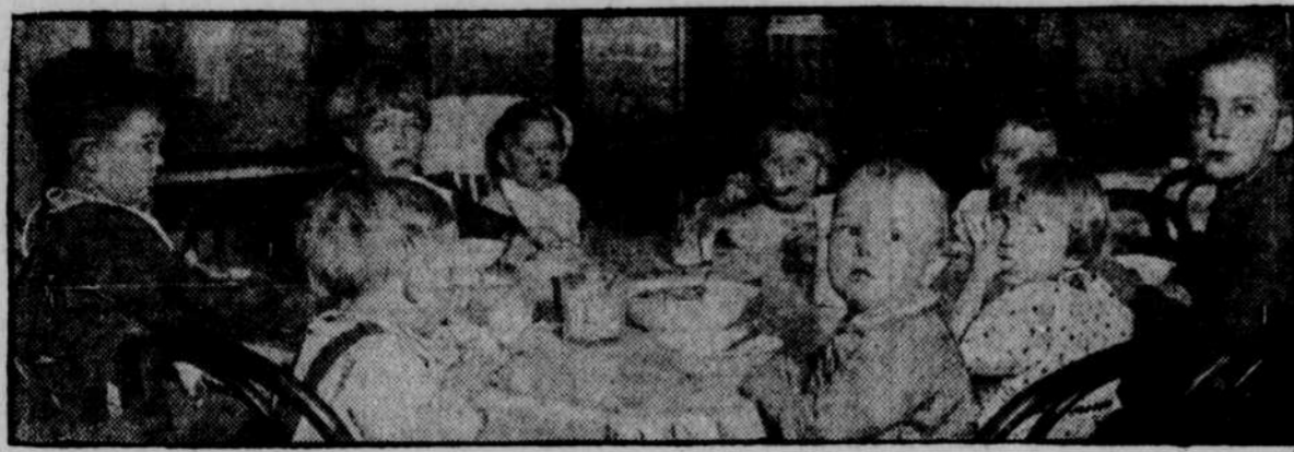
This is where nine of the 2,378 meals given out by the Omaha City Mission during the first six months of this year went. These children are typical of the hundreds who are given shelter and care at that institution during the course of a year.

pany, Nebraska Gas and Electric company.