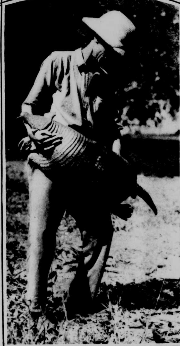
Professor William Beebe, holding the first giant armadillo captured at Kartabo in the jungles of British Guiana.