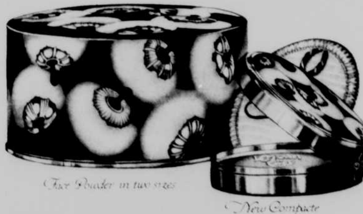
Face Powder in two sizes