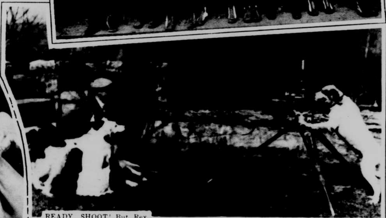
READY, SHOOT! But Rex Beach, the author, seems to take the "shooting" rather calmly as one of his many dogs takes a paw at the movie crank on the grounds of Mr. Beach's estate at Ardsley-on-the-Hudson.