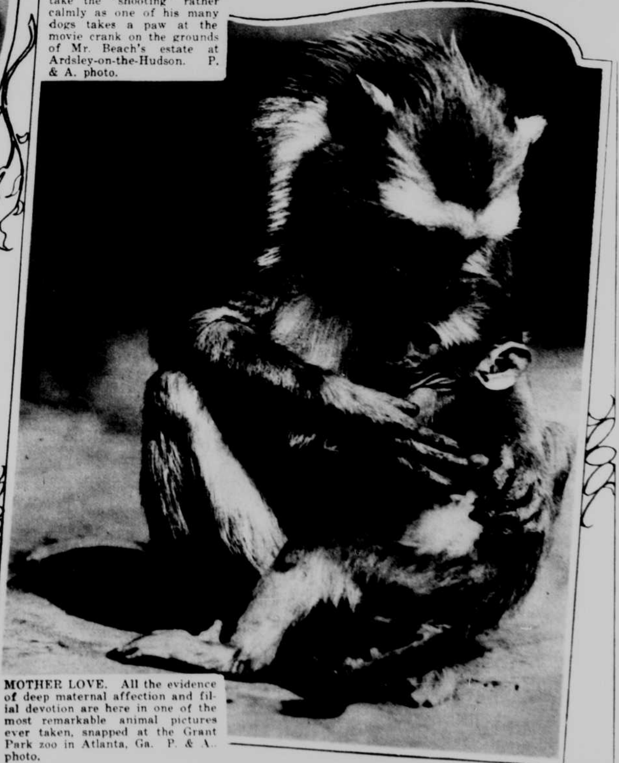
MOTHER LOVE. All the evidence of deep maternal affection and filial devotion are here in one of the most remarkable animal pictures ever taken, snapped at the Grant Park zoo in Atlanta, Ga.