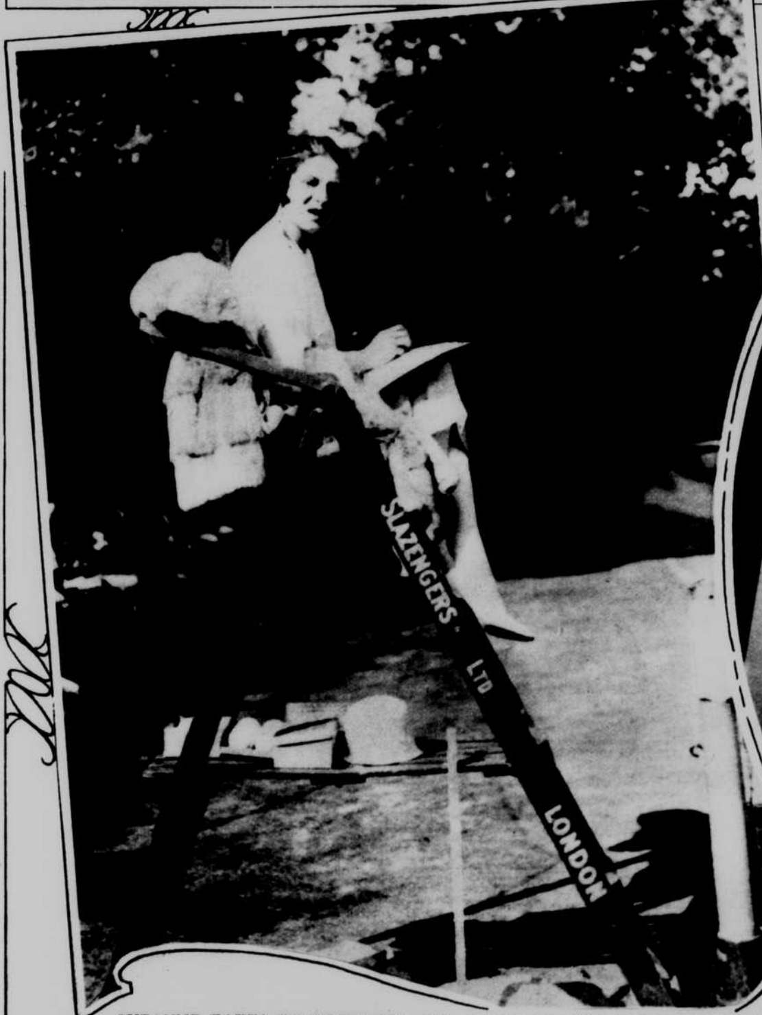
SUZANNE TAKES TO SIDELINES. Mlle. Lenglen, world's champion woman tennis player, has been indisposed lately, but she seems fairly comfortable here as she referees a match between Vincent Richards and M. Borotra held in London.