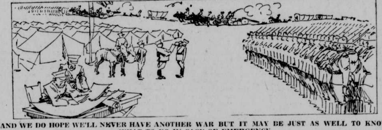
AND WE DO HOPE WE'LL NEVER HAVE ANOTHER WAR BUT IT MAY BE JUST AS WELL TO KNOW WHAT TO DO IN CASE OF EMERGENCY.