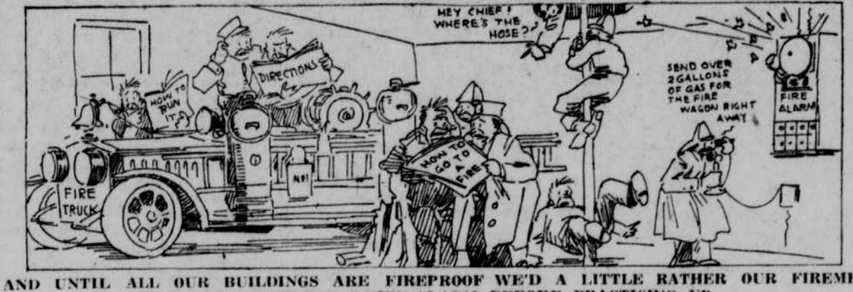
AND UNTIL ALL OUR BUILDINGS ARE FIREPROOF WED A LITTLE RATHER OUR FIREMEN WOULDN'T WAIT FOR A FIRE ALARM BEFORE PRACTICING UP.