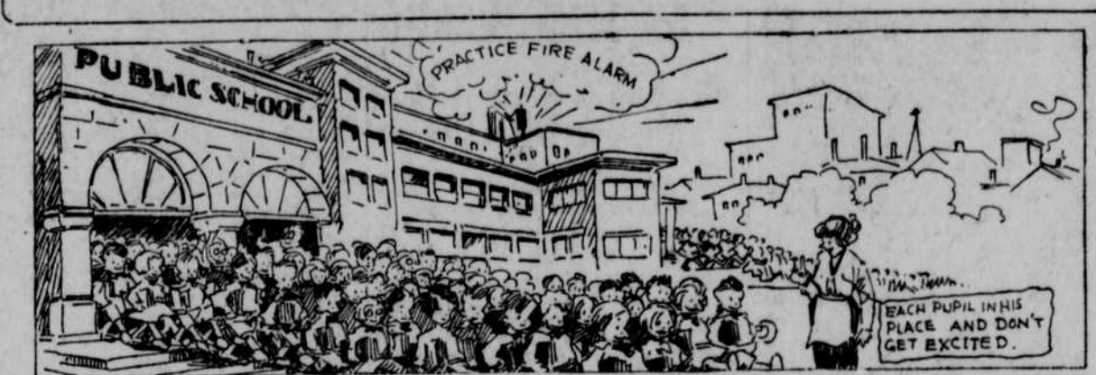
WE HOPE THERE WILL NEVER BE ANOTHER SCHOOLHOUSE FIRE BUT THAT'S NO REASON TO GIVE UP FIRE DRILL.