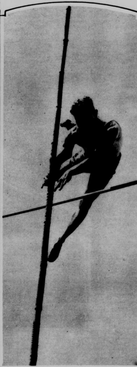
Lee Barnes of Hollywood, California who won the Olympic Pole Vault in Paris, doing 12 feet, 11 1/2 inches.