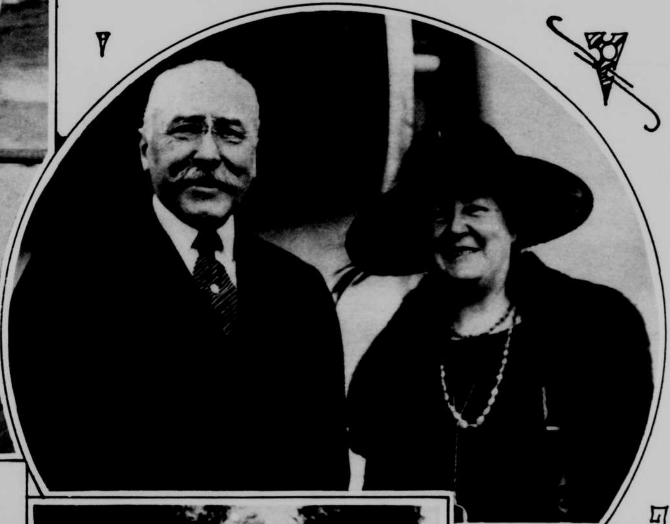
Judge Alton B. Parker and wife. Judge Parker was a candidate for President of the United States, on the Democratic ticket, in 1904. He was defeated by Theodore Roosevelt.