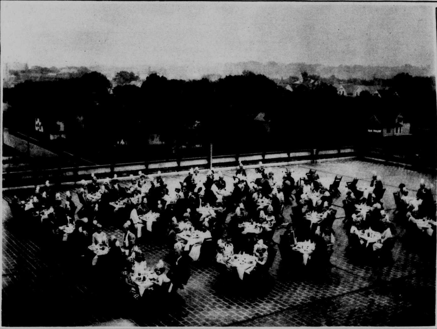
ROOF GARDEN BANQUET FOR HONOR STUDENTS. The banquet was held atop the Athletic club building for honor students of Omaha Technical high school.