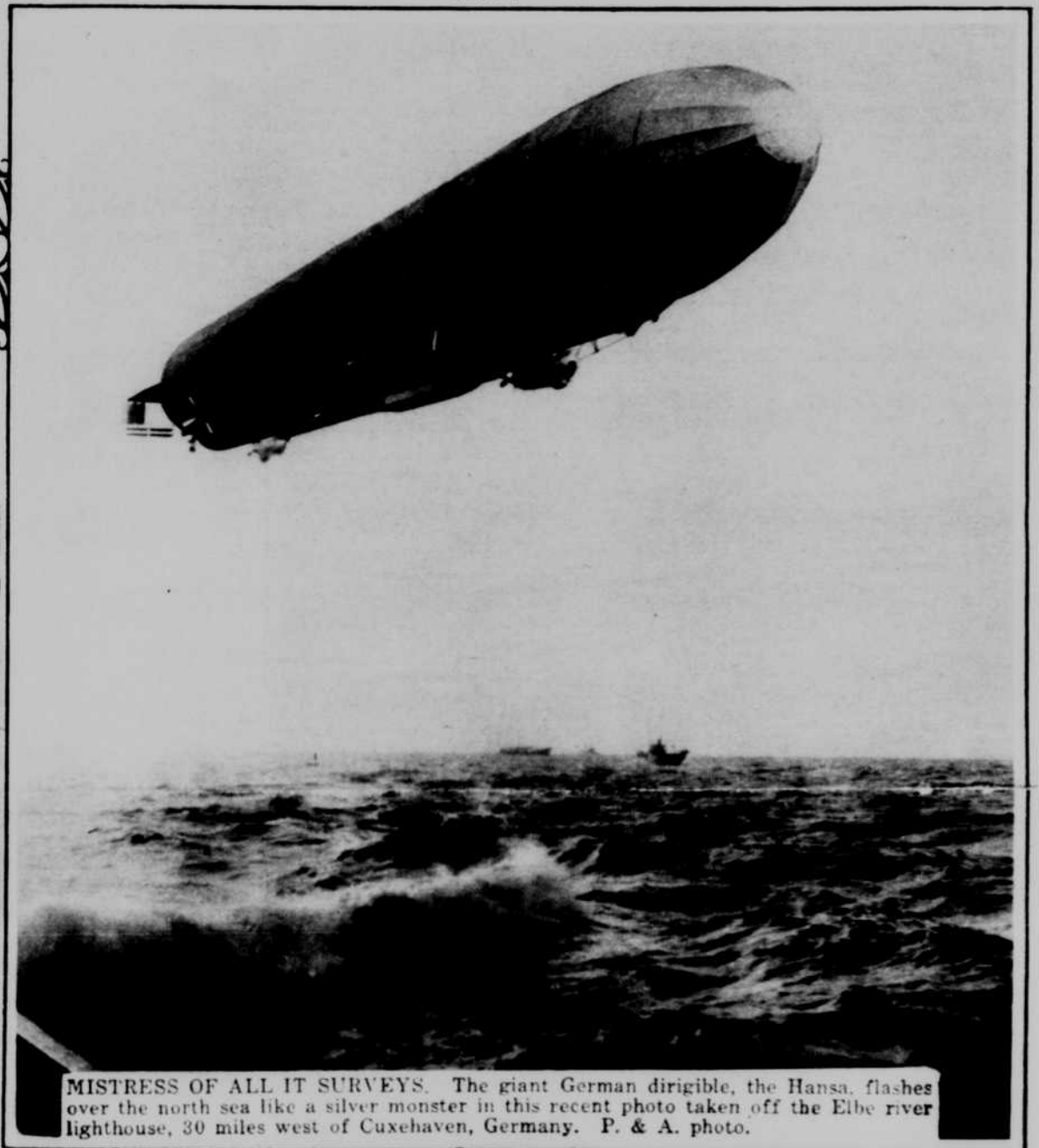
MISTRESS OF ALL IT SURVEYS. The giant German dirigible, the Hansa, flashes over the north sea like a silver monster in this recent photo taken off the Elbe river lighthouse, 30 miles west of Cuxhaven, Germany.