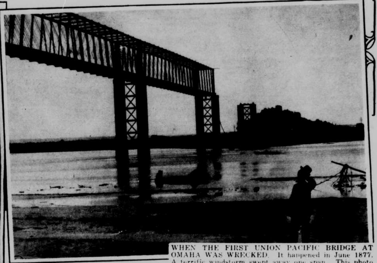
WHEN THE FIRST UNION PACIFIC BRIDGE AT OMAHA WAS WRECKED. It happened in June 1877. A terrific windstorm swept away one span.