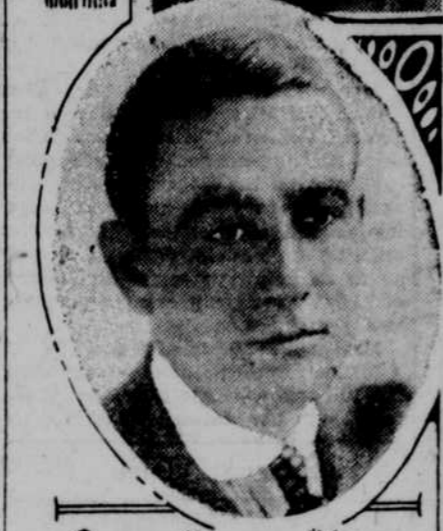
Owen Moore in "Modern Matrimony" at the Muse