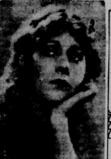
J. Warren Kerrigan and Lois Wilson in "The Covered Wagon" at the Strand