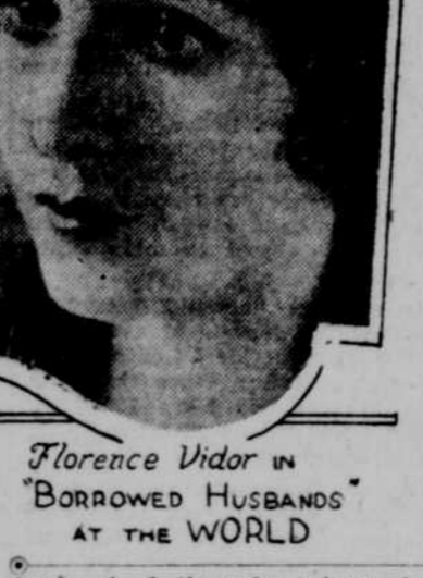
Florence Vidor in "Borrowed Husbands" at the World