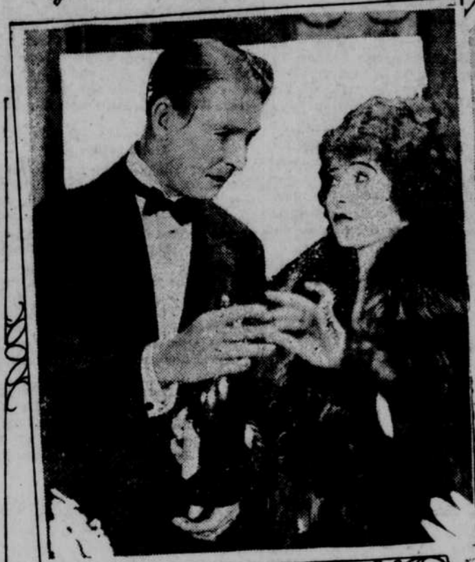
Betty Compson and Percy Marmont in "The Enemy Sex" at the Rialto