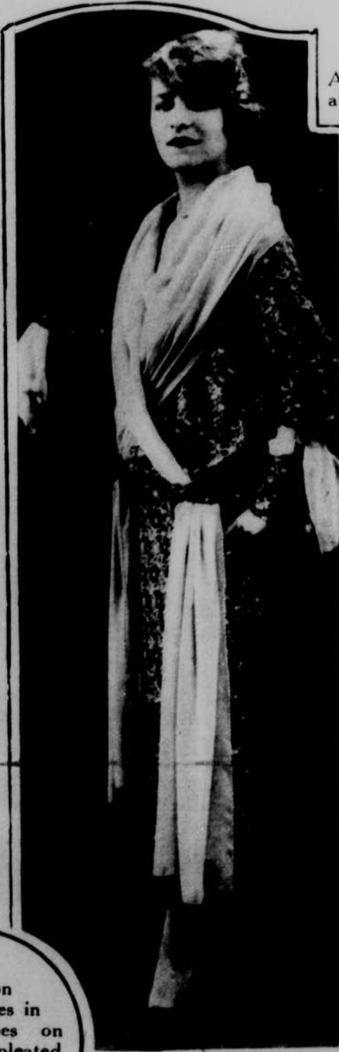
A printed afternoon dress has skirt panels and collar cunningly cut in one piece.