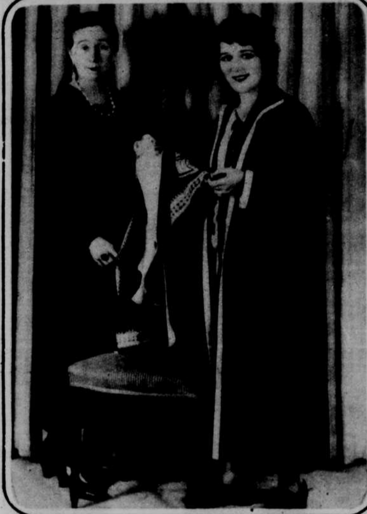
Mme. Jeanne Lanvin, famous French designer, showing Mary Pickford one of her newest models, while Mary was on a shopping "spree" in Paris.