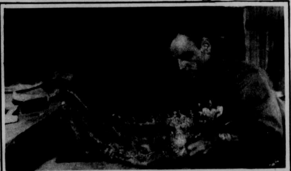
The lower jaw of a giant Titanotherium, estimated to be more than 6,000,000 years old, which was recently discovered in Mongolia.