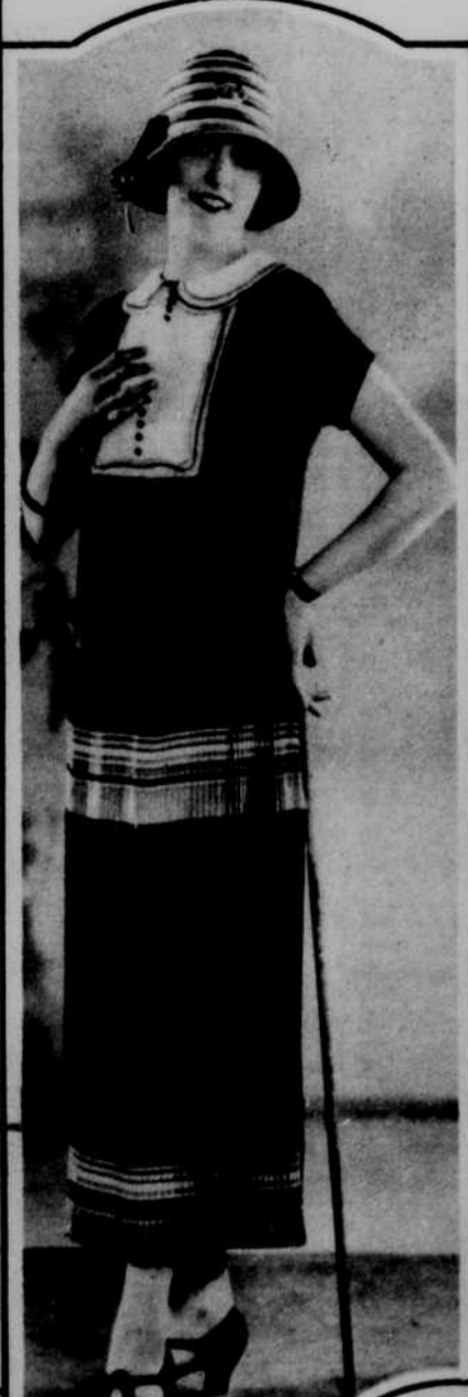
This afternoon gown glories in Roman stripes on its accordion-pleated skirt and a vestee of white satin.