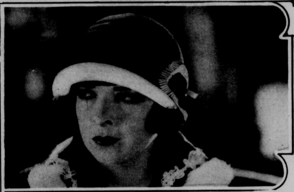
Colleen Moore, who will forego flapperish ways in her next picture, "Temperament."