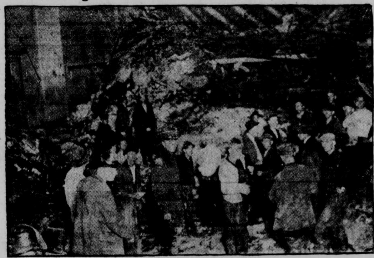
Scores lost their lives in the State theater, Lorain, when a tornado crushed the building and precipitated tons of mortar and steel upon the audience. The photograph shows bodies being removed from the building.