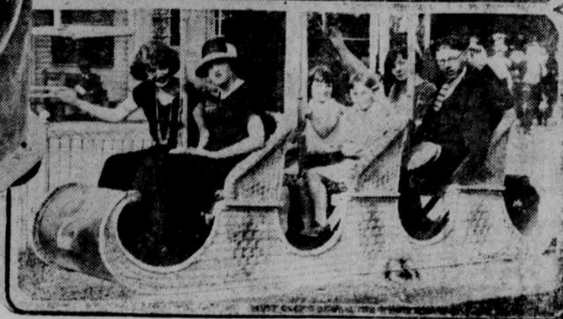
The happy smile on all these faces is sufficient proof of the fun to be had on the many rides. Above are shown a few of the park's rides—the whip with its cargo of four happy youngsters squeezed into the big "tub;" the captive aeroplane, and a close-up of some young folks enjoying the frolic. In the upper left corner are four people starting on a ride through the tropical scenery in the Swanee river.