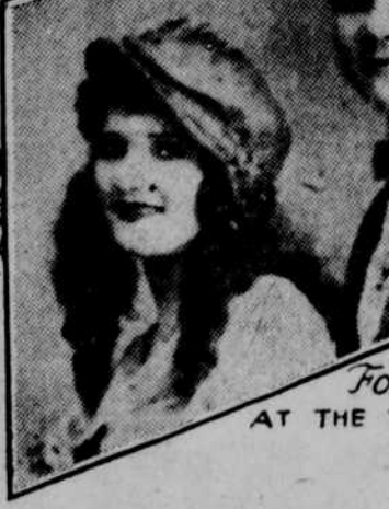
Mabel Normand Is Here in "Extra Girl"