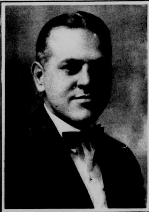
Left — WILLIE HOPPE who has been billiard champion as long as the present day generation of sport fans can remember is still at the top of his form defeating Edouard Horémans, the Belgian expert, in a recent 1500 point match held in New York by an overwhelming score.