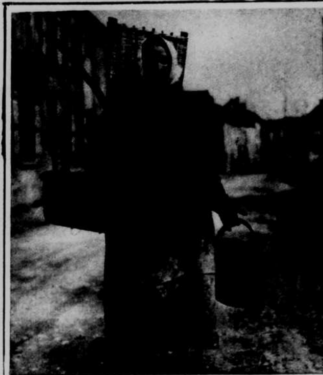
A FRENCH WAR WIDOW who smiled happily when a Yankee photographer, camera-scouting through Chartres recently pointed to the O. D. blouse she wore. It was given her by a passing doughboy in the big July rush up past Chateau Thierry six years ago.