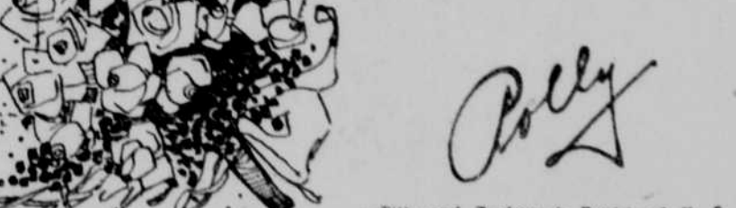
—Title and Trademark Registered U. S. Patent Office.

WHEN the little June bride views the exquisitely arranged new panels in the Hydraclic Press Brick company's showroom, main floor, W. O. W. Bldg., 14th and Farnam, she will spend every penny of her gift check from father for a Hy-Tex brick home, this is certain. Every one who is planning a new home is invited to call and inspect the showing of new and distinctive shades of brick with their appropriate mortars. A treat! Home plan books with excellent illustrations and brick color cards will be mailed upon request.