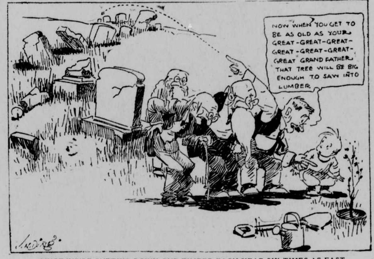
SINCE WE'RE CUTTING DOWN OUR TIMBER EACH YEAR SIX TIMES AS FAST AS IT CAN GROW, AND IT TAKES 300 YEARS TO GROW A GOOD SAWLOG