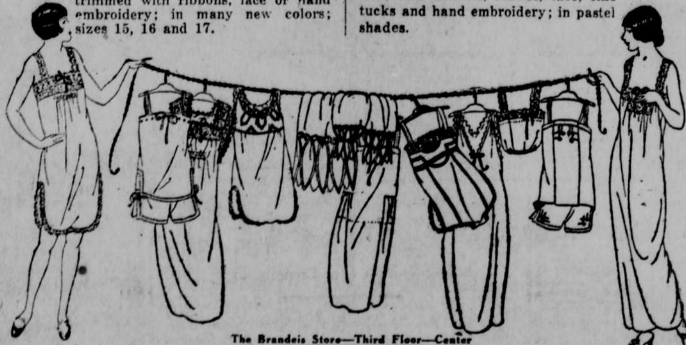
The Brandeis Store—Third Floor—Center

Shadow proof white sateen petticoats; either embroidered hems or scalloped bottoms.