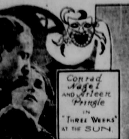
Conrad Nagel and Arleen Pringle in 'THREE WEEKS' AT THE SUN.

The Famous Georgia Minstrels will make their stage dress parade announcing their appearance at the Brandeis theater on Wednesday and Thursday, May 14 and 15, with a popular priced matinee on Thursday.