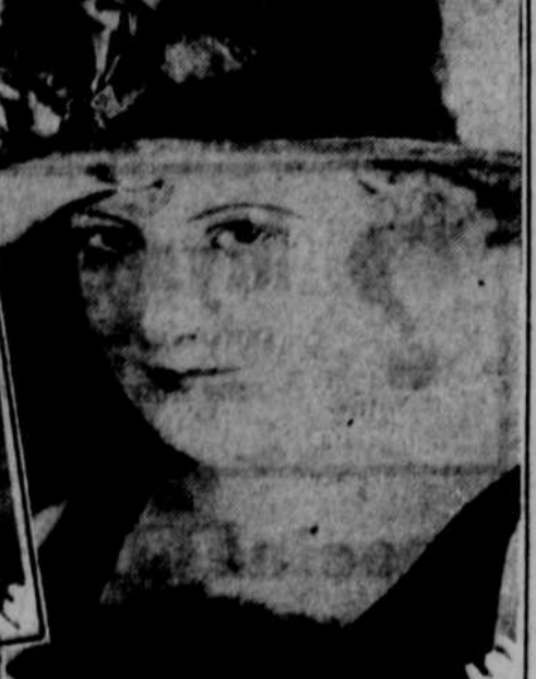
Betty Compton and Clive Brook in 'WOMAN TO WOMAN' AT THE MUSE