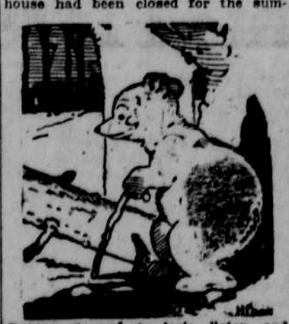
Buster stopped to look, listen and smell.

Jimmy had made his home under Farmer Brown's sugar house in the Green Forest. He liked it over there. To be sure, he missed Farmer Brown's Boy, for the latter was no longer staying in that sugar house.