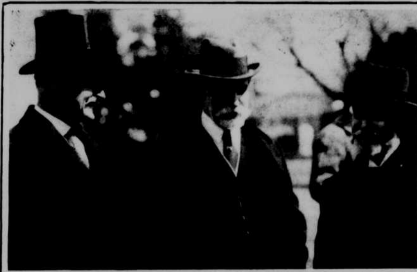
DIPLOMATS THREE. Sir Esme Howard, British Ambassador, Secretary of State Hughes and Ambassador Jusserand of France, pictured in an informal get-together outside the White House.