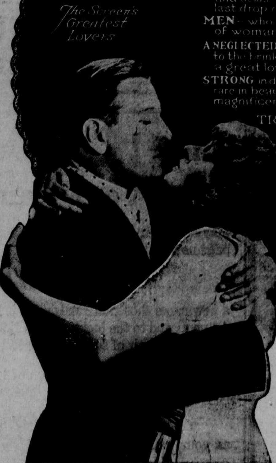
The Screen's Greatest Lovers