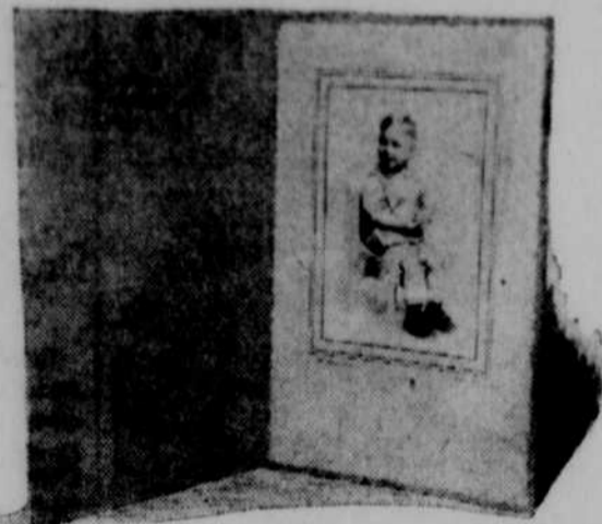
A photo of your baby as illustrated free every Friday.

Photos by Heyn assure you of an exceptional quality.