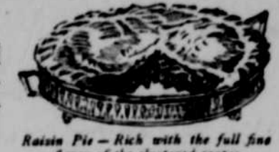
Raisin Pie—Rich with the full flavor of the clustered grapes