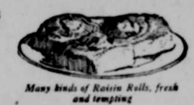
Many kinds of Raisin Rolls, fresh and tempting