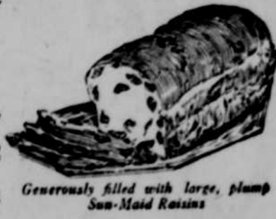
Generously filled with large, plump Sun-Maid Raisins