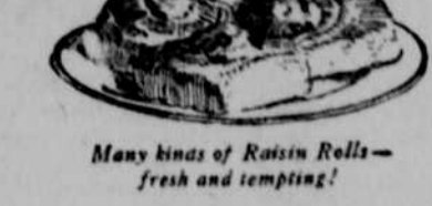
Many kinds of Raisin Rolls—fresh and tempting!