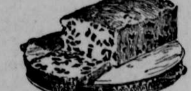
Raisin Pound Cake—rich with fruit goodness