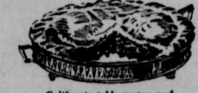
California table-grapes and California sunshine in a pie!

Serve them for dinner tonight—for your children's and your own luncheon. And—u-um!—Raisin Bread toast for Thursday's breakfast.