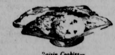
Raisin Cookies—how the children love them!