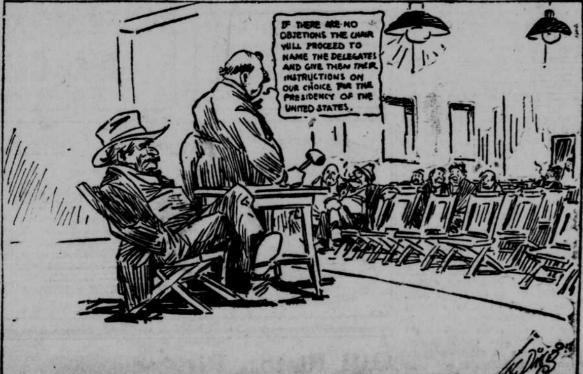
THE CROWD THAT GATHERS AT THE CAUCUS WHICH IS TO EXPRESS THE COMMUNITY'S WISH ON THE SELECTION OF CANDIDATES.