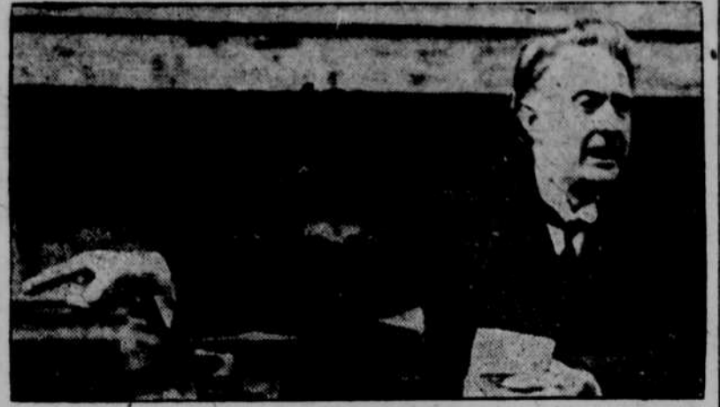
President Cosgrave addressing a political meeting in Dublin in behalf of government candidates.