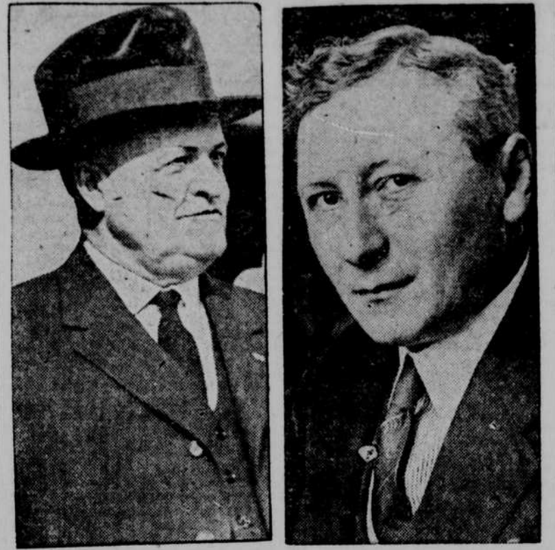
Representative John Wesley Langley of Kentucky (left) and Representative Frederick M. Zihman of Maryland testify in the oil scandal and deny grand jury bribery charges.

self placed between covetousness on the one hand and righteousness on the other, he found the situation uncomfortable, aggravating and finally terrifying.