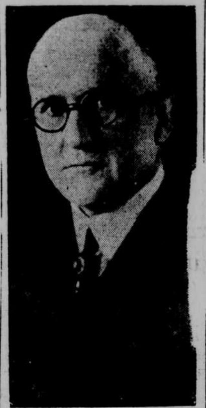
This photo shows T. Blakely Kennedy, judge of the United States court for the district of Wyoming, who will preside at the trial of the government's suit for cancellation of the Mammoth Oil company (Sinclair) lease on the Teapot Dome naval oil reserve.