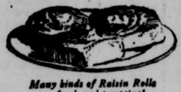
Many kinds of Raisin Rolls—fresh and tempting!