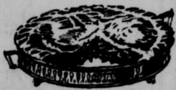
California table-grapes and California sunshine—in a pie!