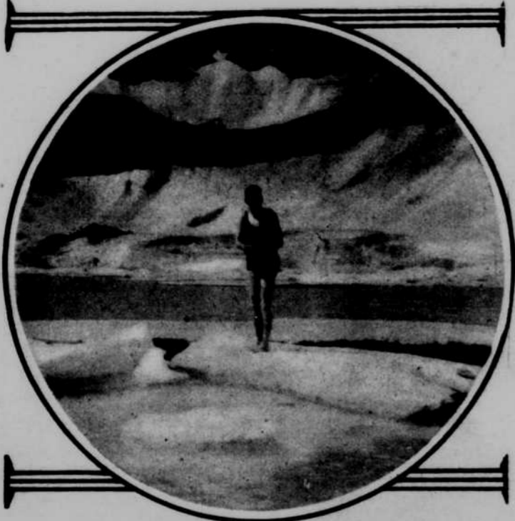
COLD FEET, and nothing else but — for this winter frolicker in Glacier National Park. And no way back to the mainland and a roaring fire except to plunge into the icy current and swim for the shore.