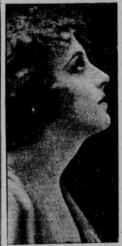
Estelle Taylor, film actress, plans to establish a clearing house for budding players who come to Hollywood in search of film fame. Miss Taylor also hopes to start a school where training can be given promising talent.