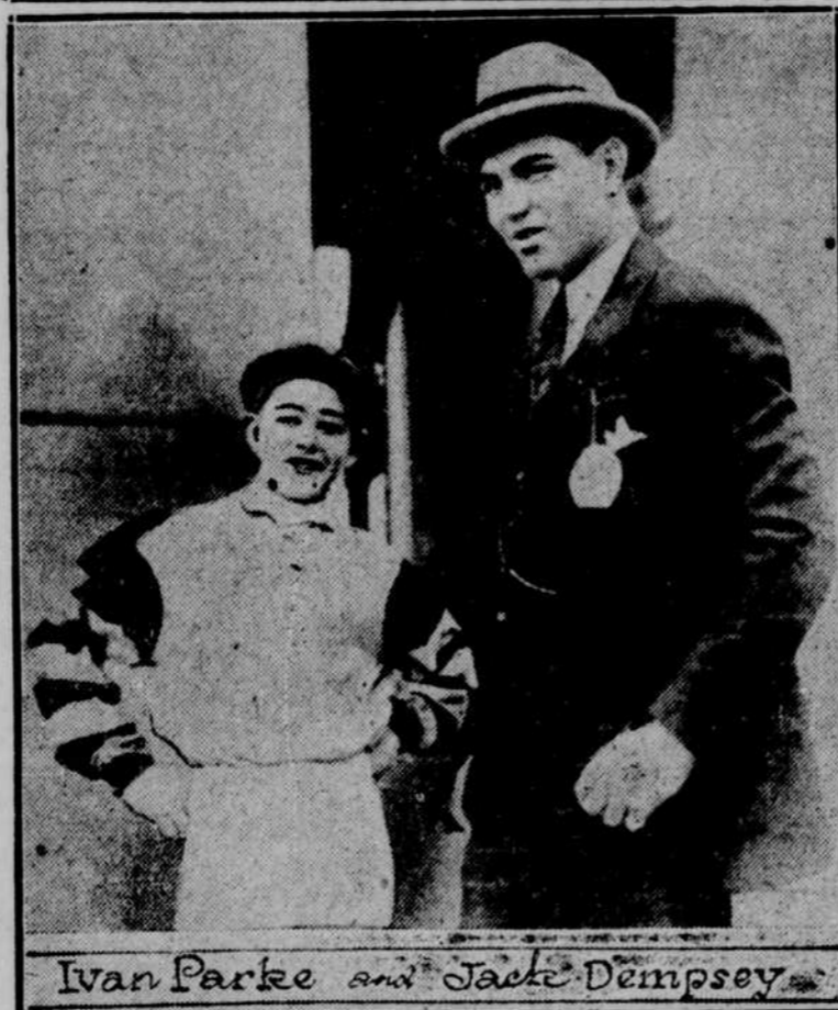
Ivan Parke, 16-year-old jockey, whose sensational victories have led experts to declare he is destined to be the best rider in the world, is shown here with Jack Dempsey, world's heavyweight champion, who also is called the best ever, taken at the New Orleans race track, where Parke is riding.