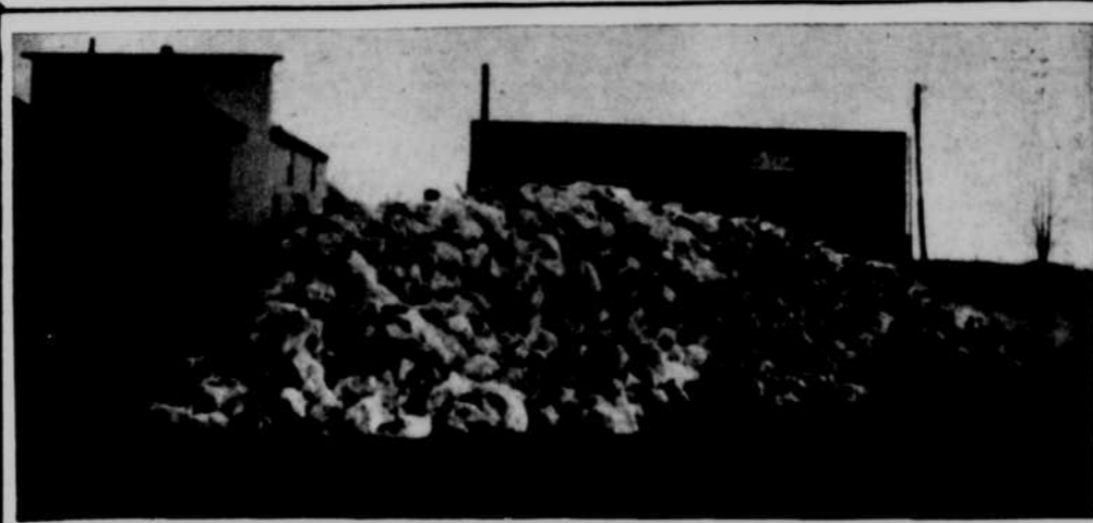
A MOUNTAIN OF RABBITS. Picturing one-half of the biggest bag of jack rabbits ever taken in North Dakota. This is one of two piles of slain bunnies (7,250 in all), the result of a three-day hunt staged by men at New England, N. D., near Bismarck.