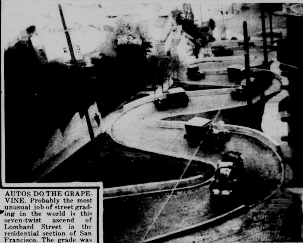
AUTOS DO THE GRAPE-VINE. Probably the most unusual job of street grading in the world is this seven-twist ascend of Lombard Street in the residential section of San Francisco. The grade was formerly 30 per cent, but the regrading improvements reduced it to 17 per cent. What an ideal driver's license test this hill would make? And what a tremendous problem it would present for an inebriated chauffeur!